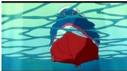
Sous la surface - 1 -