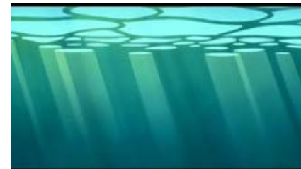
Sous la surface - 4 -